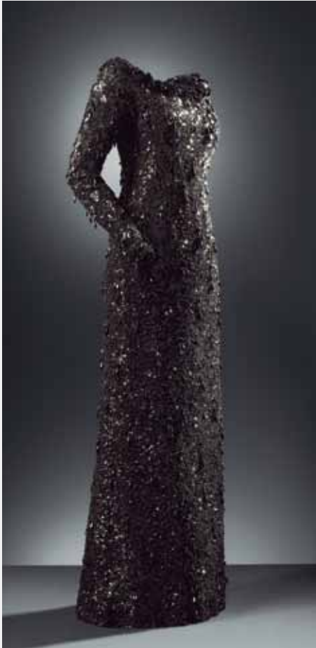
EISA Madrid, 1964.

Tunic dress in black silk satin and machine-made tulle in the same colour, embroidered with sequins and glass-paste beads.