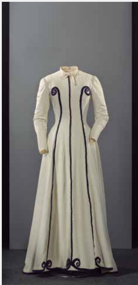
BALENCIAGA Paris, 1939.

Evening dress in white ottoman silk and navy blue piping appliqué. It has a mandarin collar with a ribbon tied into a long bow, and fastens at the front with a zip. The sleeves are puffed. The piping appliqués that decorate the front start as scrolls at the chest then run in vertical lines down the bodice. This model represents a tribute by Balenciaga to his great friend Elsa Schiaparelli, the leading exponent of the influence of Surrealism in fashion.