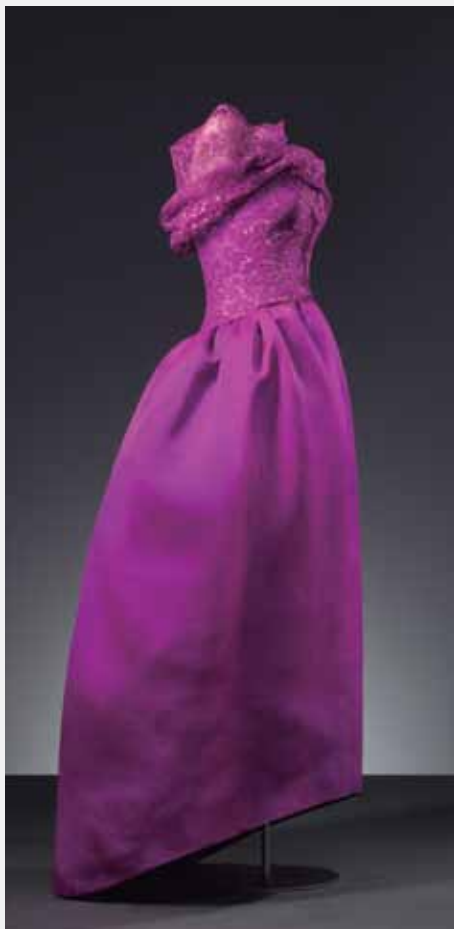
BALENCIAGA Paris, 1958.

Cocktail ensemble: dress and jacket in black and white damask.