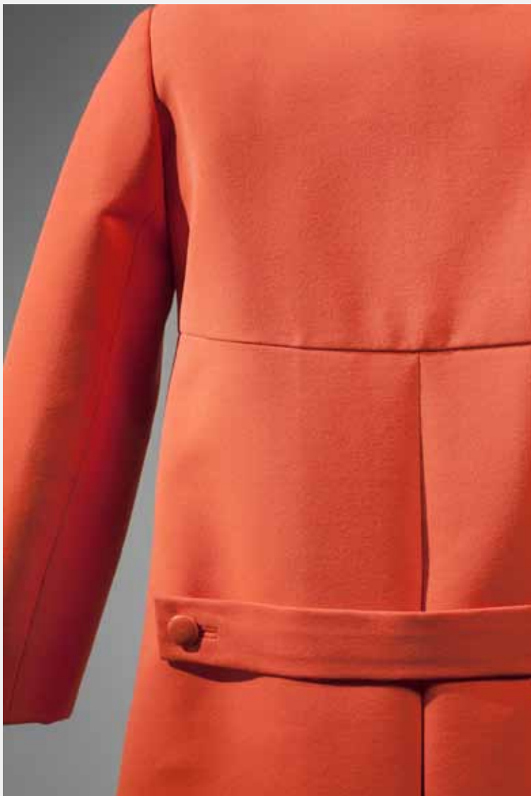
EISA Madrid, 1964.

Straight day coat in orange rayon twill, with a jewel neckline and turndown collar. The focal points are the double row of buttons at the front and the precise cut below the chest. The vertical seams at the front conceal the pockets.