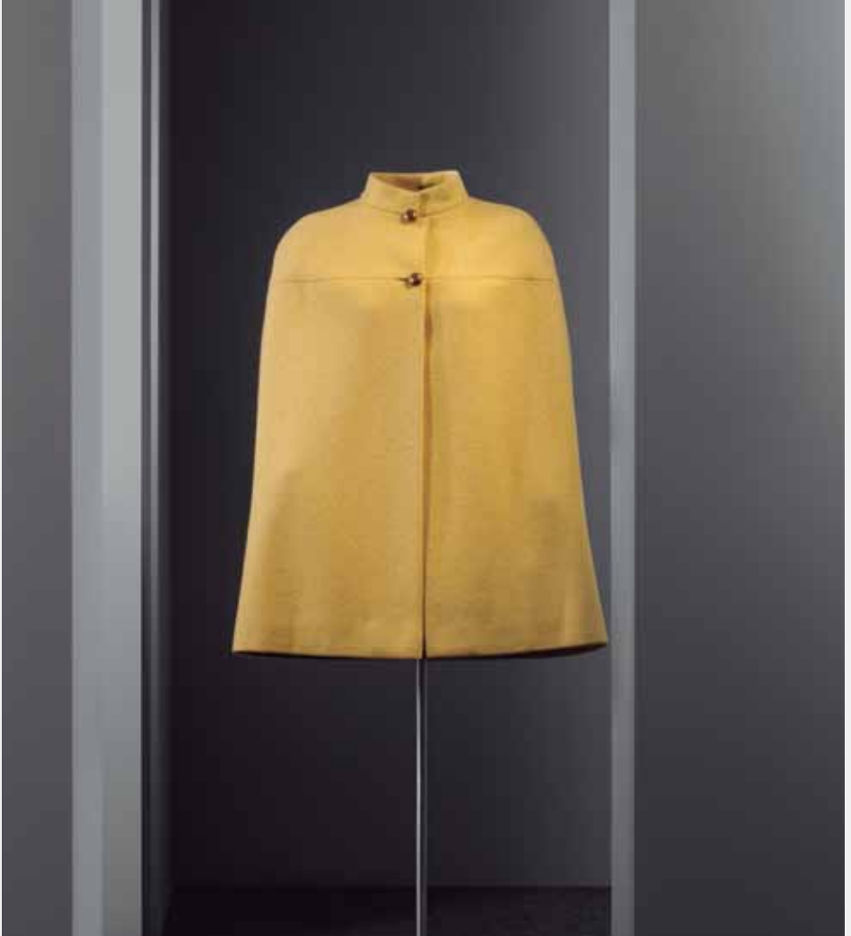
BALENCIAGA Paris, 1967.

Yellow wool cape with mandarin collar and yoke at both front and back. It fastens with one button at the neck and another at the yoke.