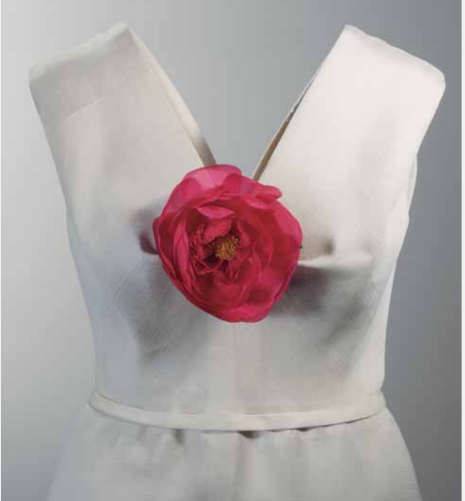
BALENCIAGA Paris, 1966.

Evening dress in ecru gazar. The bodice is cut on the bias and has a V-neck at both the front and back. A drape generates volume at the front of the neckline, which is decorated with a flower, while a bow accentuates the plunge back. The skirt falls to the floor, forming a slight train.