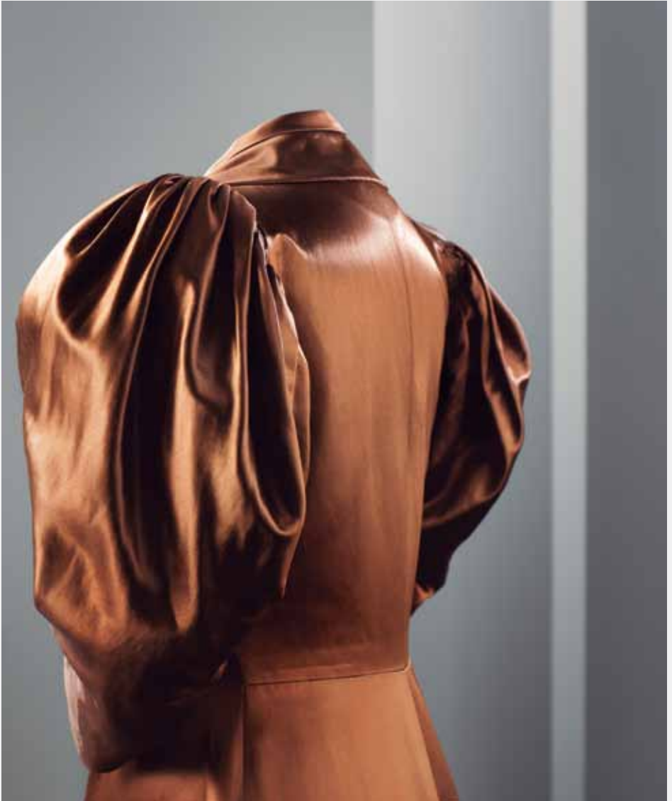
BALENCIAGA Paris, 1938.

Evening déshabillé in brown silk satin. It fastens at the front with buttons covered in the same fabric, and has a large lapel collar and puffy leg-of-mutton sleeves. In this model, Balenciaga created a subtle interpretation of the riding habit worn by women in the 19th century.