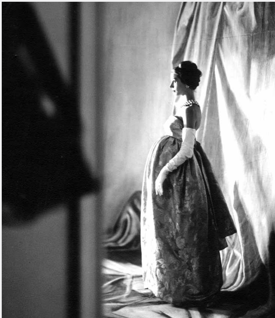
EVENING DRESS, 1960. Balenciaga Archives, Paris.