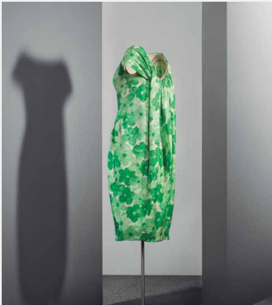
EISA Madrid, 1961.

Cocktail dress in white wild silk, with a floral pattern in different shades of green. The front of the dress has a cut at the waistline, straight at the front and curved at the sides, and a plunging boat neck. However, the focal point of the dress is the voluminous drape at the back.