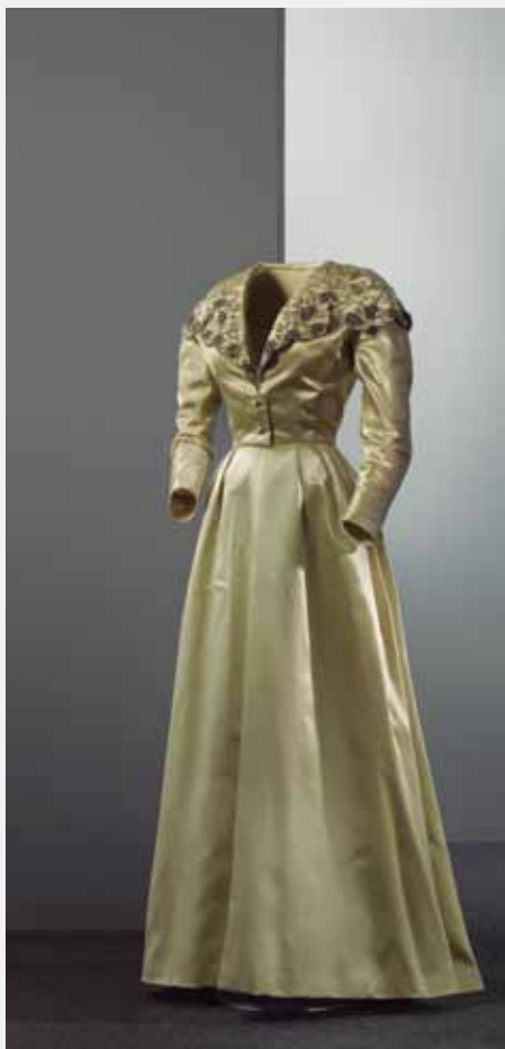
BALENCIAGA Paris, 1939.

Evening dress in white ottoman silk and navy blue piping appliqué. It has a mandarin collar with a ribbon tied into a long bow, and fastens at the front with a zip. The sleeves are puffed. The piping appliqués that decorate the front start as scrolls at the chest then run in vertical lines down the bodice. This model represents a tribute by Balenciaga to his great friend Elsa Schiaparelli, the leading exponent of the influence of Surrealism in fashion.