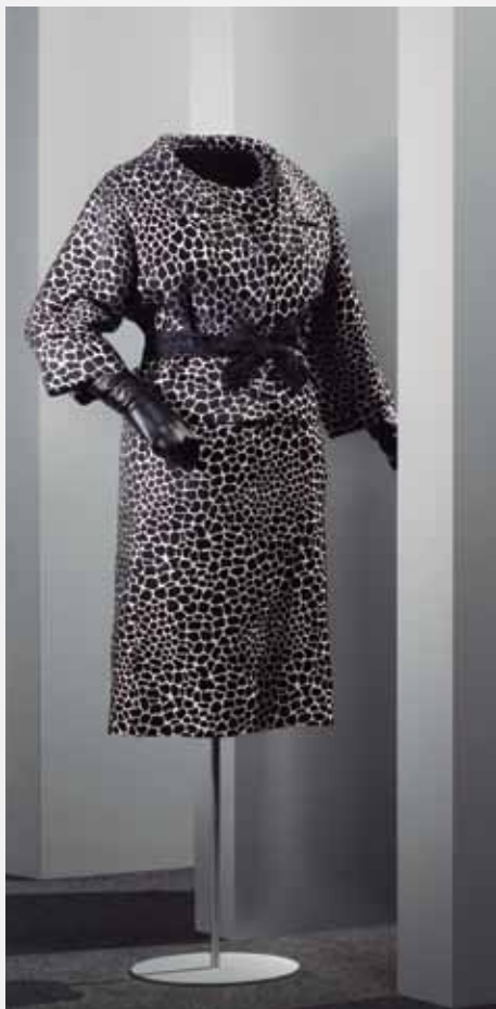
EISA San Sebastián, 1959.

Cocktail ensemble: dress and jacket in black and white damask.