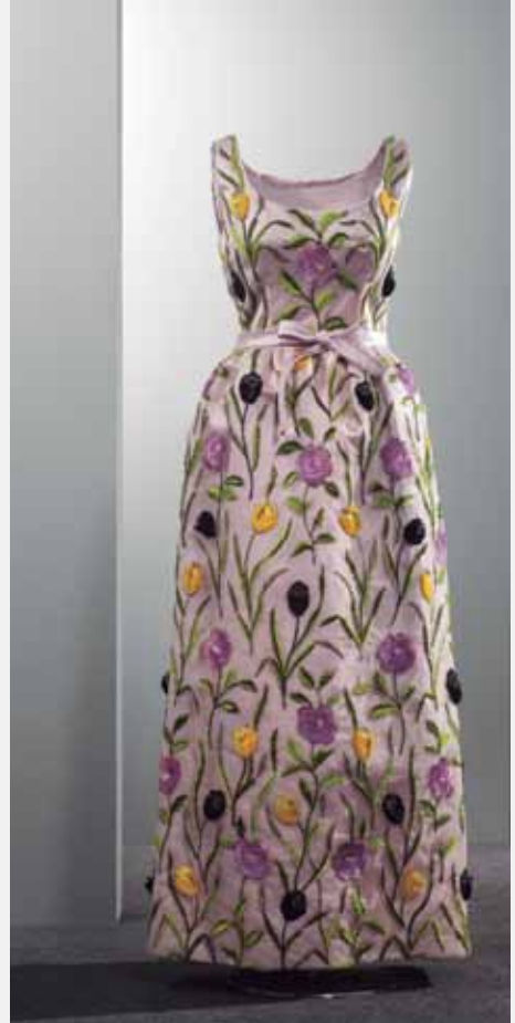
BALENCIAGA Paris, 1960.

Tunic dress in black silk satin and machine-made tulle in the same colour, embroidered with sequins and glass-paste beads.