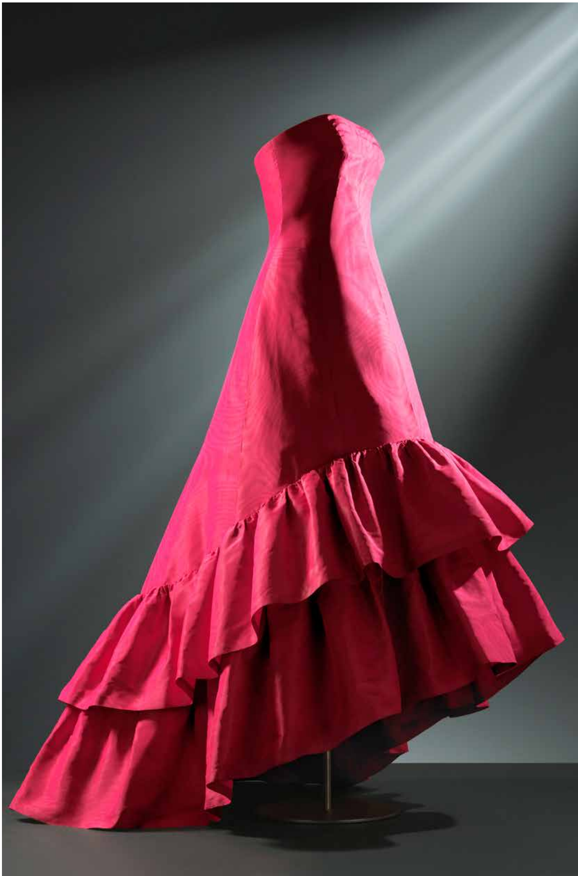
CBM 02.1999 Evening gown in fuchsia moiré taffeta with two ruffles.1963