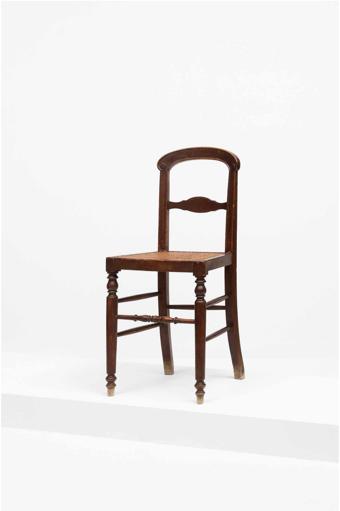
CBM 2000.228 Chair from the atelier at 10 Avenue Georges v in Paris