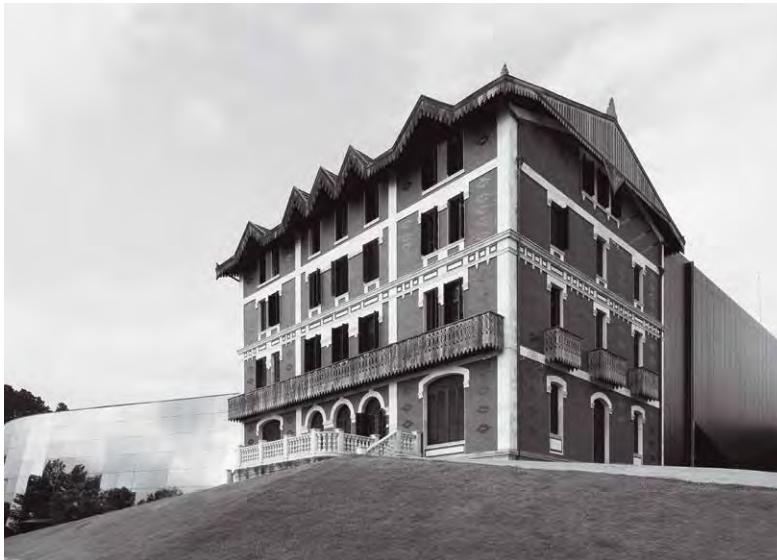
Exterior view of the Cristóbal Balenciaga Museum in Getaria

The Cristóbal Balenciaga Museum, inaugurated 7 June 2011, is located in Getraia, the designer's hometown and the stage for Cristóbal Balenciaga's first years of training and professional maturing. This is essential to understand his contributions to fashion.