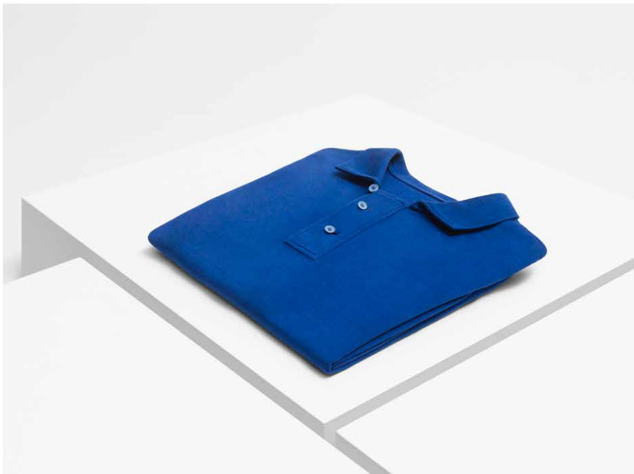
CBM 2000.93 Klein polo shirt in blue jersey that belonged to Cristóbal Balenciaga

The Museum's collections include Cristóbal Balenciaga's creations, but also the items that belonged to him and that help us to discover the different biographical, cultural and professional contexts Balenciaga lived in. Those nearest the designer (family, collaborators, workers, friends) preserved these items and have generously donated or loaned them to the Museum to be displayed.