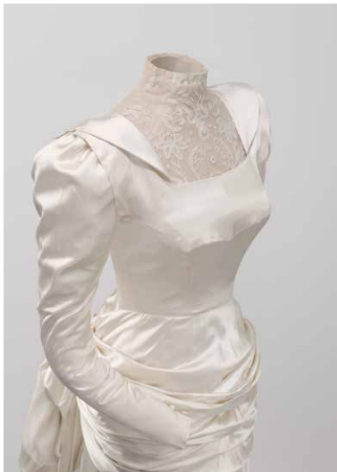
CBM 02.2002 Bridal gown in ivory silk satin with a lace collar and round train, draped at the hip, 1945

Balenciaga impressed the critics beginning with his first collection in the French capital, thanks to his technical mastery and creations whose Spanish airs set them apart. However, WWII broke out immediately afterward. For years, the scarcity in materials, new feminine roles and a patriotic spirit set the style for military-inspired fashion for a society pouring its efforts into the war.