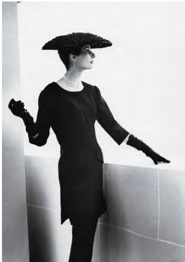
Two examples of the creative legacy of Cristóbal Balenciaga: "tunic" and "midi"

The exhibition's journey ends in 1968 when the maison closed, also referencing the later process of granting heritage status to his work while he was still alive and after the creator passed away.