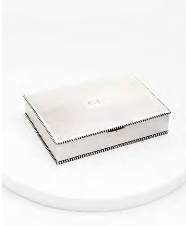
Silver box marked with the initials C.B.