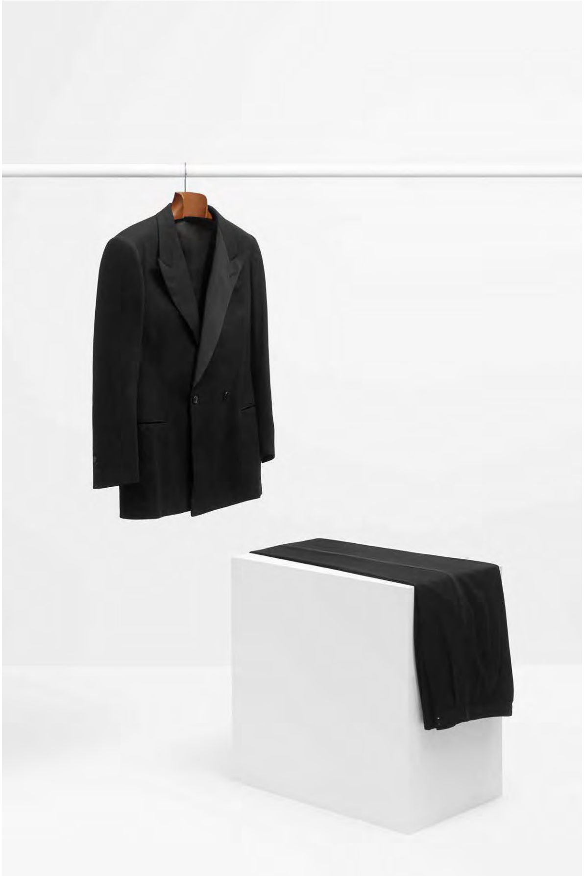
CBM 2000.128ab Dinner ensemble in navy blue wool Opelka, Paris, 1939