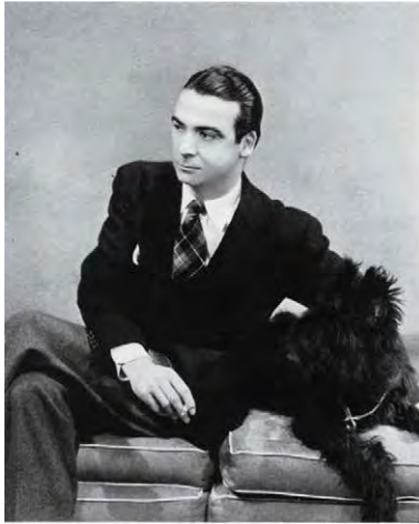
Cristóbal Balenciaga portrait by Man Ray © Harper's Bazaar , 1940