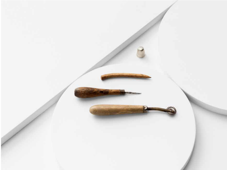
CBM 2000.155-158 Tools (metal awl, wooden awl, tracing wheel and thimble), 1968