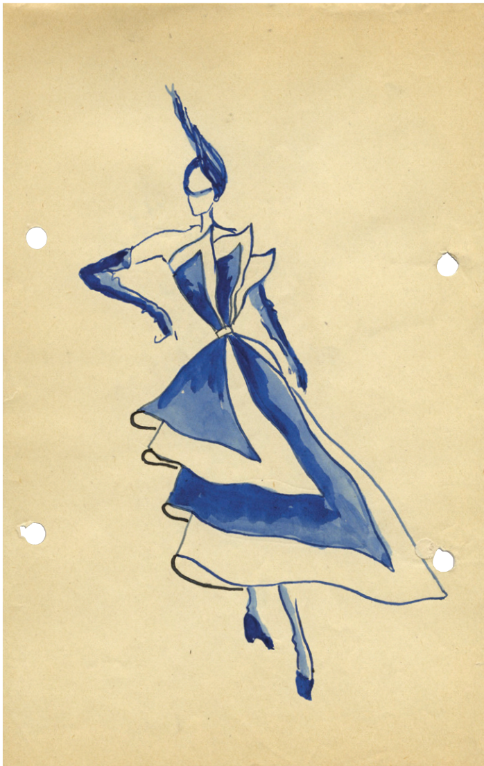
Artistic drawing. 1950s Riva Collection. Historical Archive of the Basque Country

"I am very pleased that the drawings are now being preserved in the Museum Cristóbal Balenciaga. It is the right place for them. I am sure they will be studied and valued as they should. Fashion is not only a business; it is history, a reflection of society at a given moment", explained the 84-year-old Riva, who travelled from his home in Monza, Italy, to attend the opening of the exhibition, and contribute several of his own designs.