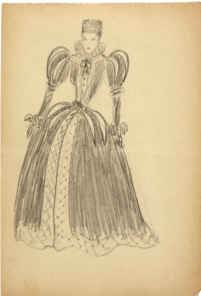
Theatre costume sketch, 1942

The collection includes a substantial number of sketches made for theatre costumes in the 1940s. These sketches reflect an extensive and detailed knowledge of historical costume and feature some of the designs created for the actress Alice Cocéa for her role in Echec à Don Juan (1941).