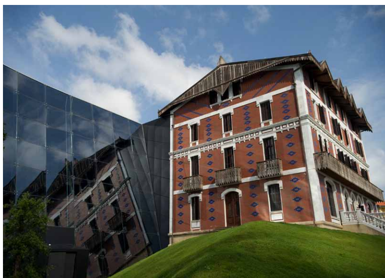
Exterior view of the Cristóbal Balenciaga Museum in Getaria.

The Cristóbal Balenciaga Museum, opened on 7 June 2011, is located in the town where the couturier was born, in commemoration of those early years of his professional training and maturing in order to understand his contributions to the world of fashion.